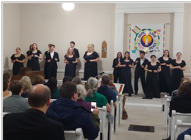
The singers gleefully rocked this fun, rhythmic tune.

◆ The Colchester Historical Society and the United Church of Colchester partnered again to present the Colchester High School Chamber Singers and Chorale on December 12 at the historically beautiful brick church in the village. The musical program included "Grow, Little Tree," "O Magnum Mysterium," "All on a Cold Winter's Night," and others. The concert was lovely with an appreciative audience; it was followed by fellowship and a wonderful variety of delicious food.