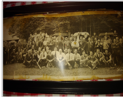
Close-up of the baseball team in center front of photo