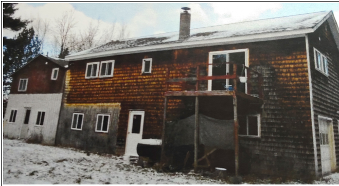
1601 West Lakeshore Drive as it appeared in 2019.