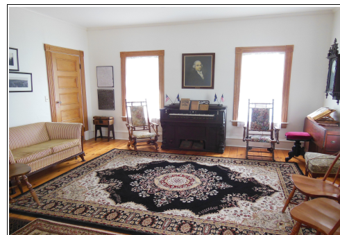
Interior of the Parsonage, built in 1899

Funds from dues and additional donations help pay for our program expenses and minor expenditures for general maintenance operations of the Historical Society, its collections, and the Parsonage building. We have no paid staff; all services are performed by dedicated volunteers. Your support is very much appreciated and will help ensure that the work we do to discover, learn about, and share Colchester's significant local history will continue.