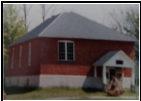
The same building, just prior to demolition in 1980.