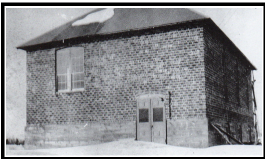
Ethan Allen Camp #12466 of the Modern Woodmen of America in its early days.