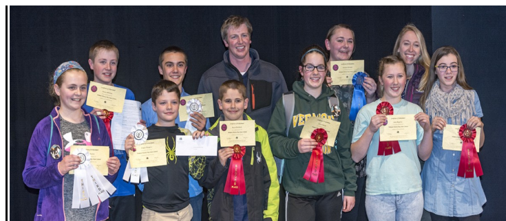
Vermont History Day winners from a previous year.

The Vermont Historical Society has done some fancy scrambling and organization to re-schedule the in-person Vermont History Day originally set for April 4. Because of the current health pandemic, this event will now be held as a virtual event the week of May 2. This year's theme is "Breaking Barriers in History."