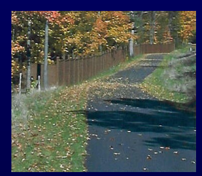
Bayside Bike Path