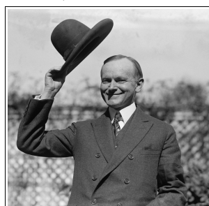
President Calvin Coolidge

Visit President Calvin Coolidge's historic home, decorated as it would have been in 1872 when he was born. In addition to special exhibits, family friendly activities will include sleigh rides, music, craft demonstrations, chocolate making and sampling, and more.