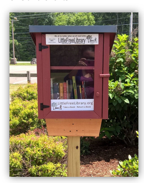
Little Free Library located at Airport Park