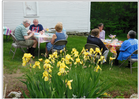
Special thanks to our volunteer gardeners for lovely early summer blooms!

Our Annual Barbecue and Annual Meeting was held on the lovely grounds of our Main Street Building on June 10. Following the meal, we conducted a short business meeting and discussed ideas for upcoming programs.