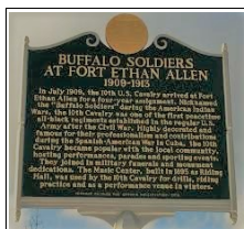
This Vermont Historic Marker is located at Fort Ethan Allen in Colchester.

The Vermont African American Heritage Trail explores the stories of early African American