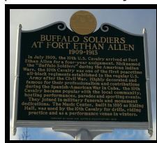
Historic site marker at Fort Ethan Allen.