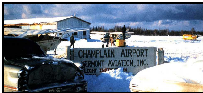
Champlain Airport, circa 1961.

Several interesting historical topics around the State are featured, including Colchester's Champlain Airport and The Buffalo Soldiers of Fort Ethan Allen. Be sure to take a look!