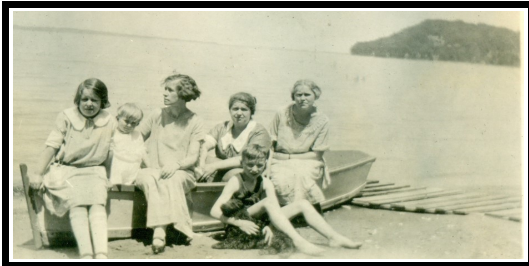
Relaxing on the shore with Montreal cousins.