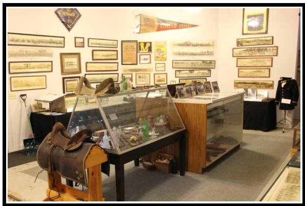
Fort Ethan Allen Museum