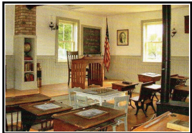
Interior schoolhouse exhibit.