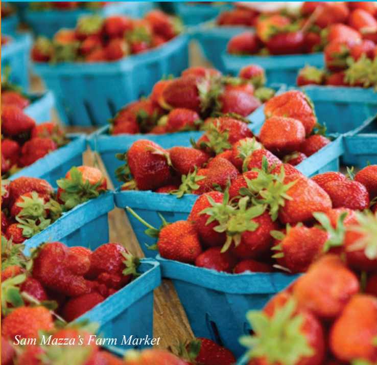
Sam Mazza's Farm Market

The Lake Champlain Byway is a collection of interconnected scenic roadways designated by the State of Vermont for their unique collection of intrinsic and scenic assets. From North to South, the formal route is 134 miles (215 km) and travels U.S. Route 2 through the Champlain Islands, U.S. Route 7 through Milton, Colchester, Winooski, Burlington, and several surrounding towns, concluding in Addison County. Learn more at www.lakechamplainbyways.com .