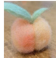
Adult Crafts – Zentangle, Cyanotypes, Needle Felting

What else? Over the summer, 256 children and teens signed up to be Summer Readers and in August celebrated all the books they had read with a visit from the Palmer Lane ice cream truck.