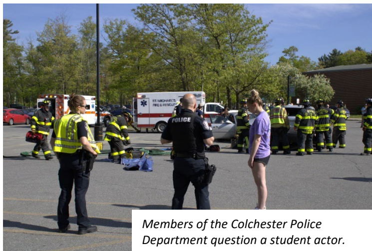
Members of the Colchester Police Department question a student actor.

Thank you to the Colchester School District for hosting this powerful event.