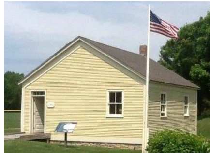
Colchester's c. 1815 log schoolhouse located at Airport Park

For more information about the Colchester Historical Society, please visit https://colchestervt.gov/422/Colchester-Historical-Society , and its Facebook page.