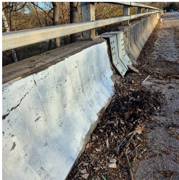
Graffiti removal on the Heineburg Bridge

Thank you to the Conservation Commission for dedicating time and effort to making Colchester a beautiful place to live!