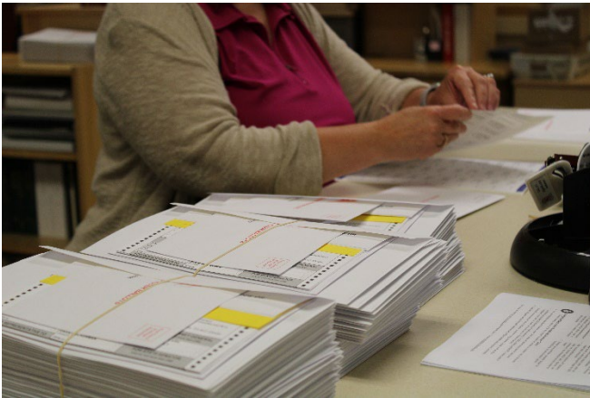
Staff in the Clerk's Office preparing ballots.