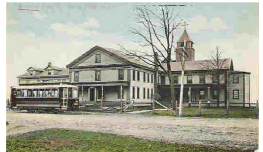
Electric trolleys served users of Fanny Allen Hospital in the early 1900s.

For more information about the Colchester Historical Society, please visit https://www.colchestervt.gov/422/Colchester-Historical-Society . Also, check out their Facebook page at https://www.facebook.com/ColchesterVermontHistoricalSociety