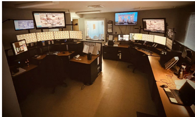
The communications center at the Colchester Police Department