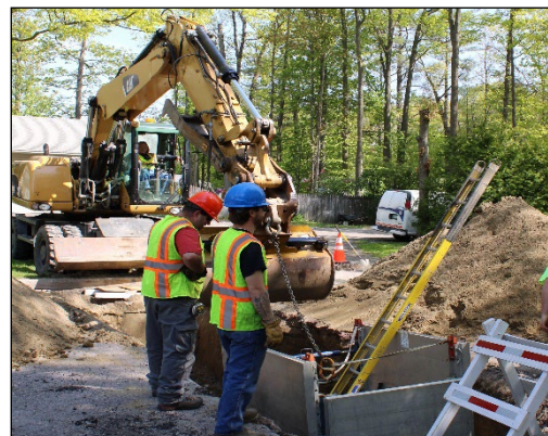
Crews replace a damaged culvert on Thomas Drive.

Public Works Crews in Action: The Town Highway Department has been active this summer with regularly scheduled maintenance and repairs. So far, they have completed 12 culvert replacements with three more scheduled before winter. Culverts are open-ended drainage pipes that are installed under a roadway or driveway and used to move water from one side to the other. The Town has recently completed a number of culvert “upsizing” projects, which helps protect our roadways and other property in the event of heavy rains.