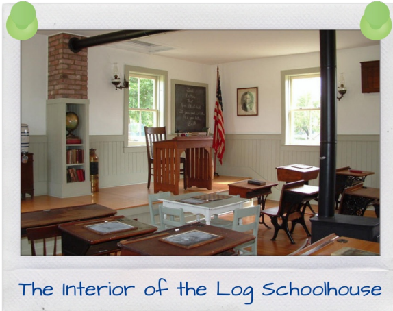
The Interior of the Log Schoolhouse