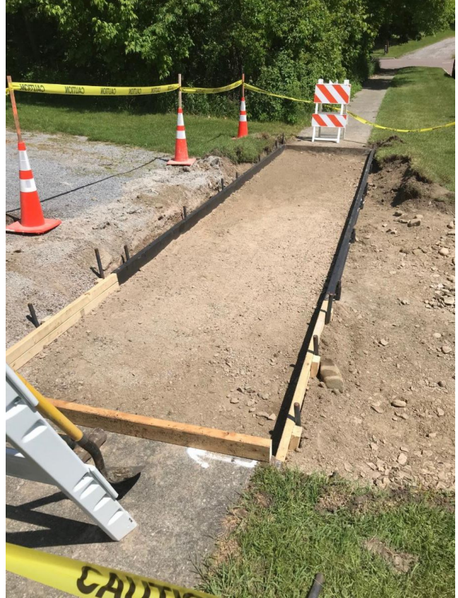
Village Drive sidewalk work.