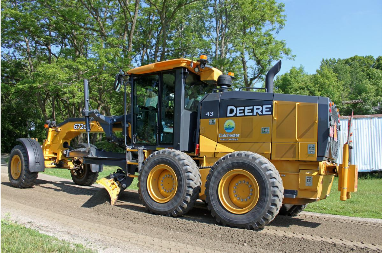
Grading on Macrae Rd. last week.